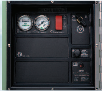
Curbside Instrument Panel with (SSAM) Shutdown System & Annunciation Module.