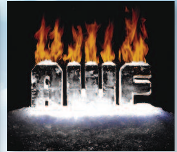
Sullair AWF Compressor Fluid Improved hot and cold weather lubrication. Longer compressor fluid life. Extended air end warranty.