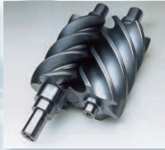
Rotary Screw Compressor by Sullair The pioneer in rotary screw technology.