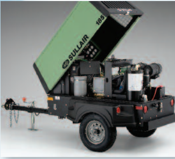
Clam Shell Canopy Compact/Lightweight design.